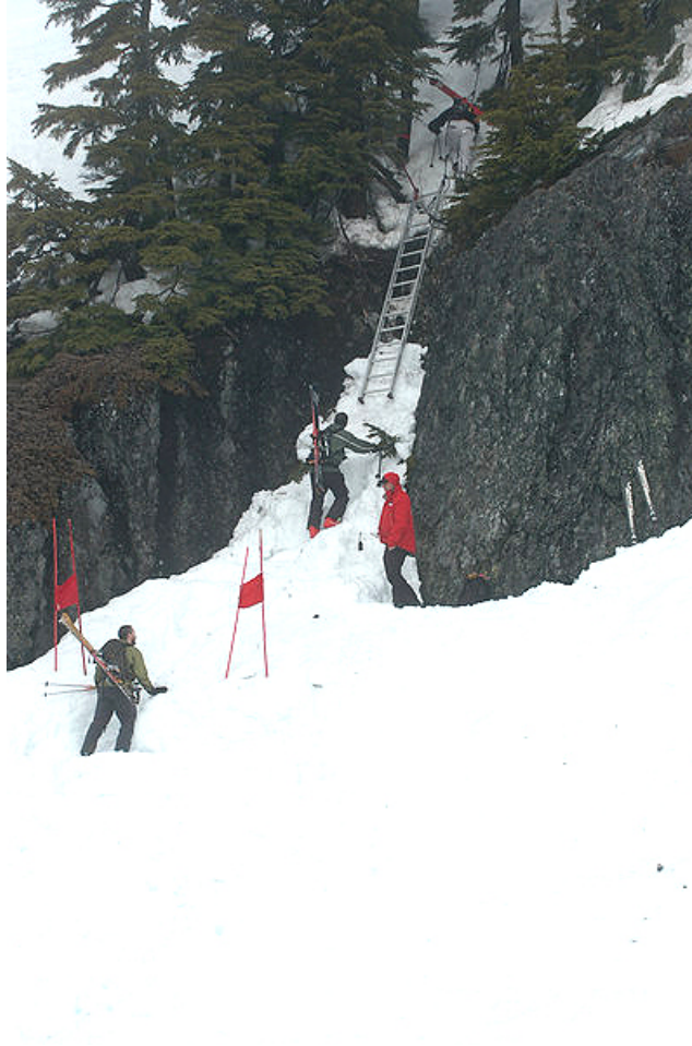
The ladder was a big hit, and right under Chair 2 so everyone could watch