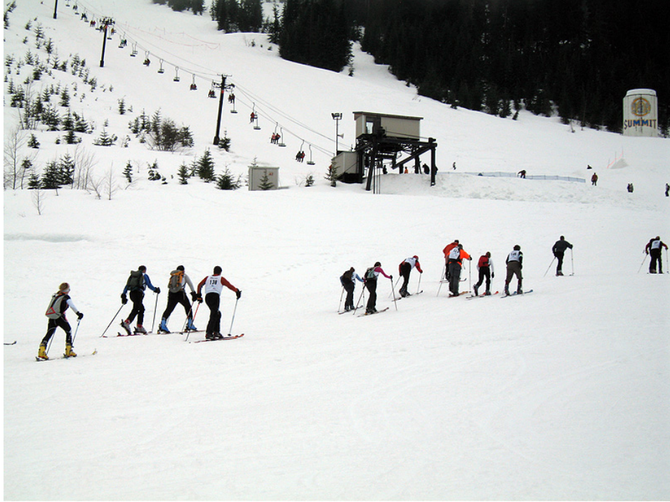
The main pack heads up chair # 1 - the leaders were already at the top of the run!