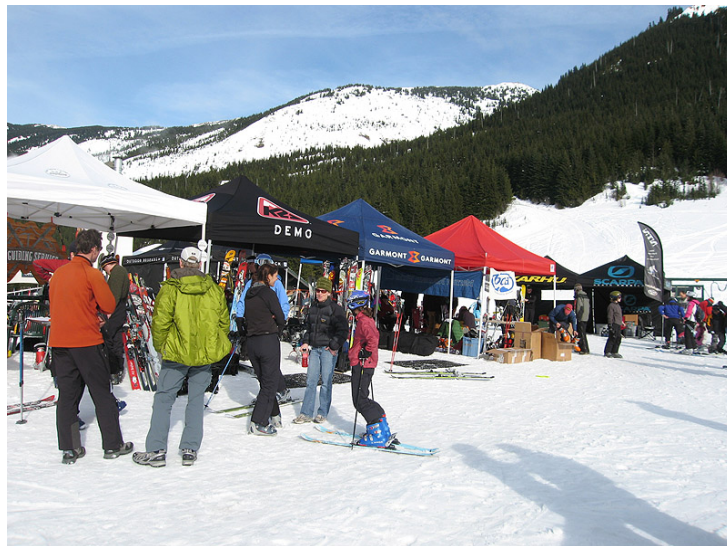
Anybody who's anybody had a booth at Vertfest, and plenty of ski and boot demos were on hand, including the real NTN telemark binding and new boots like the F3 from Scarpa